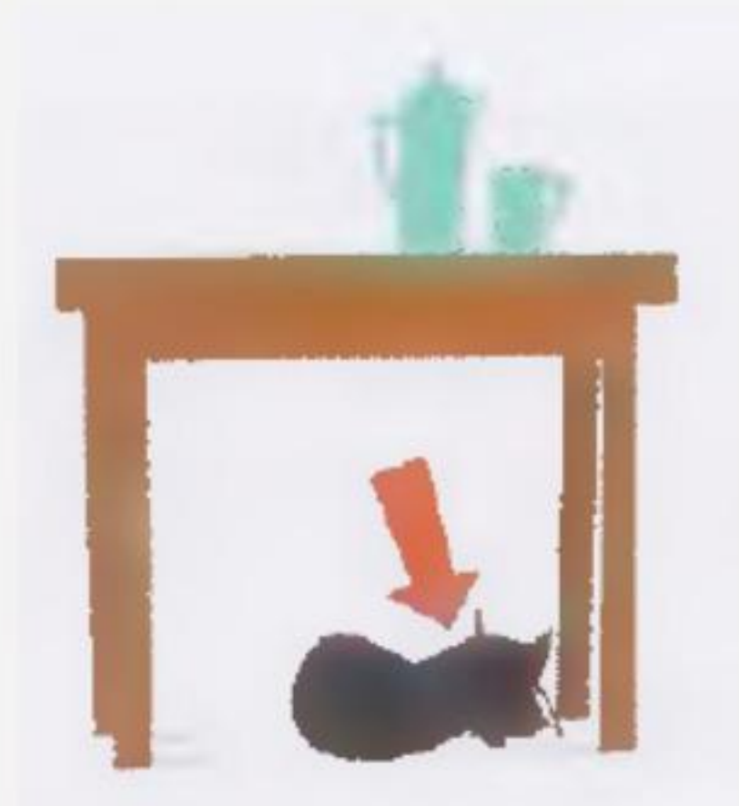
under the table