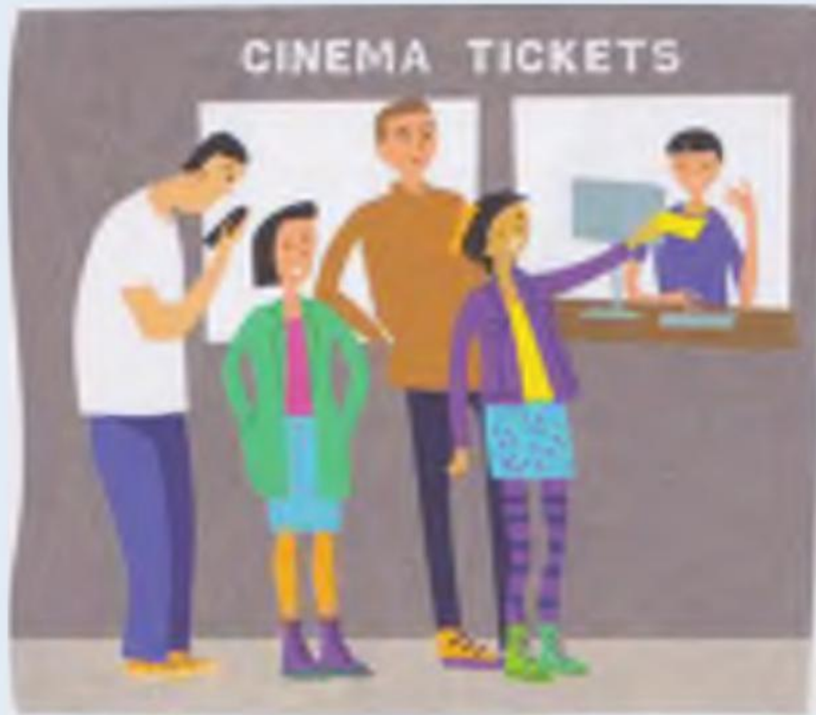
before the film