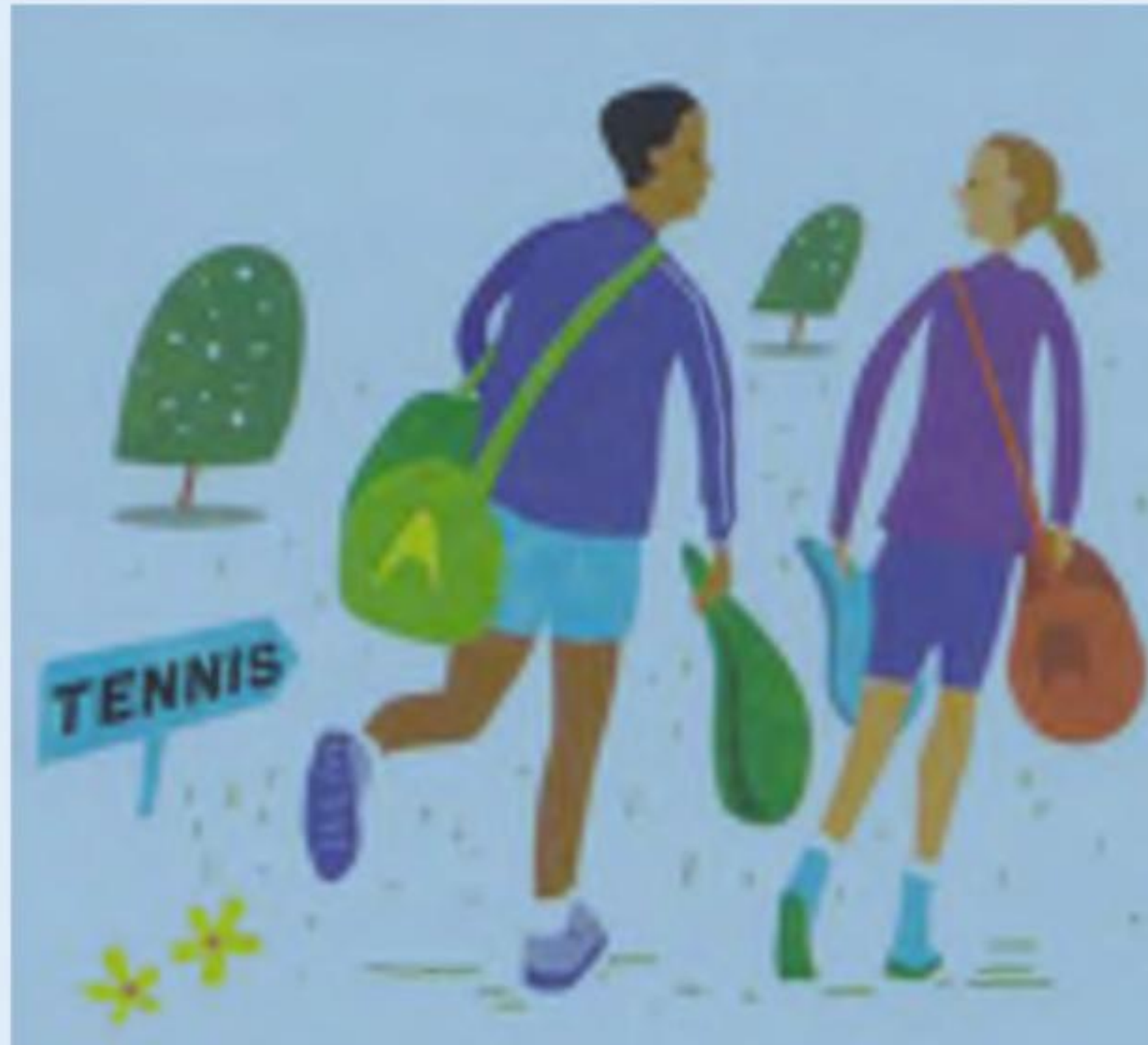
before we played