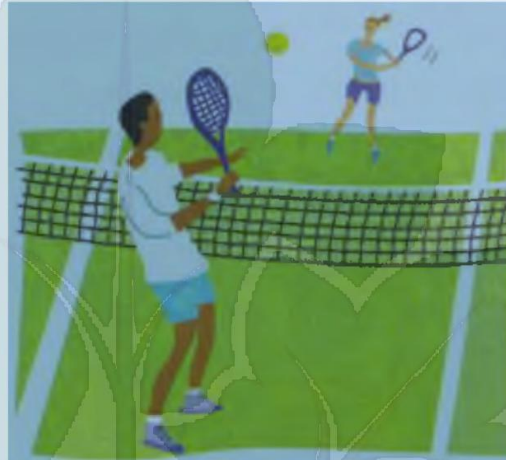
while we were playing