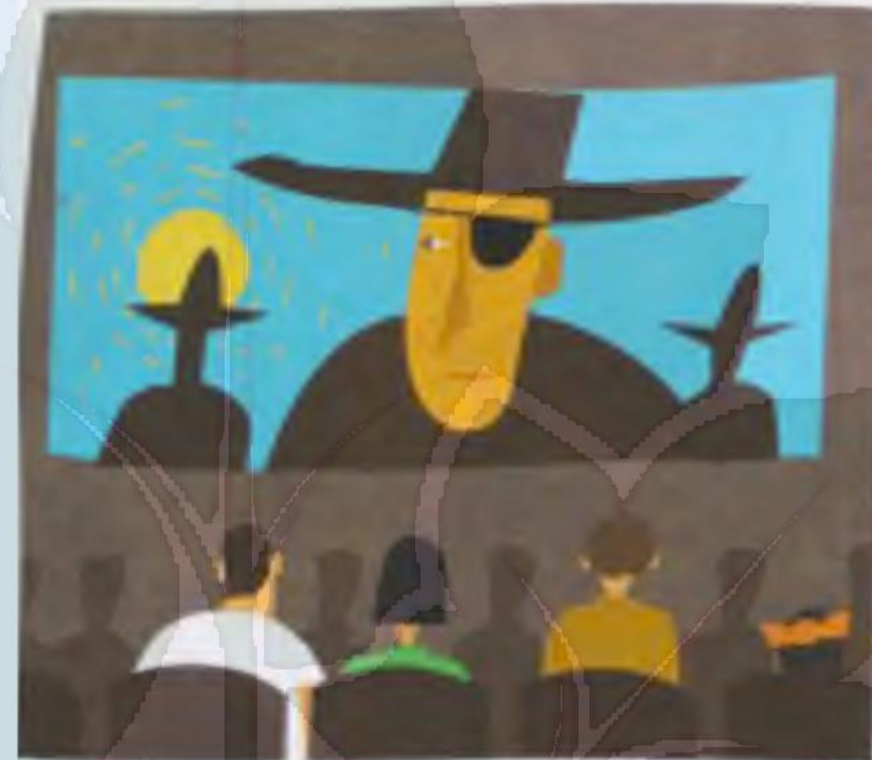
during the film