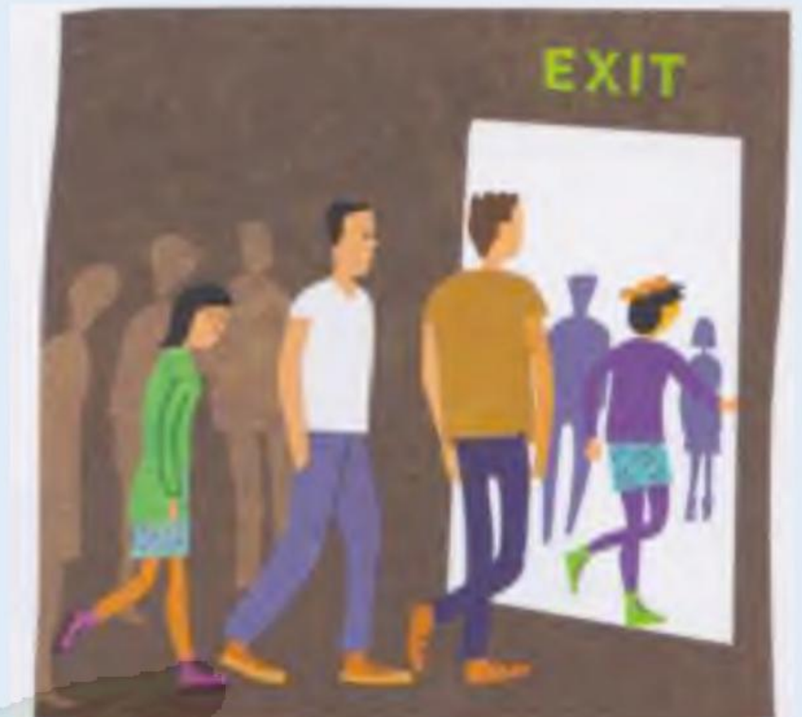
after the film