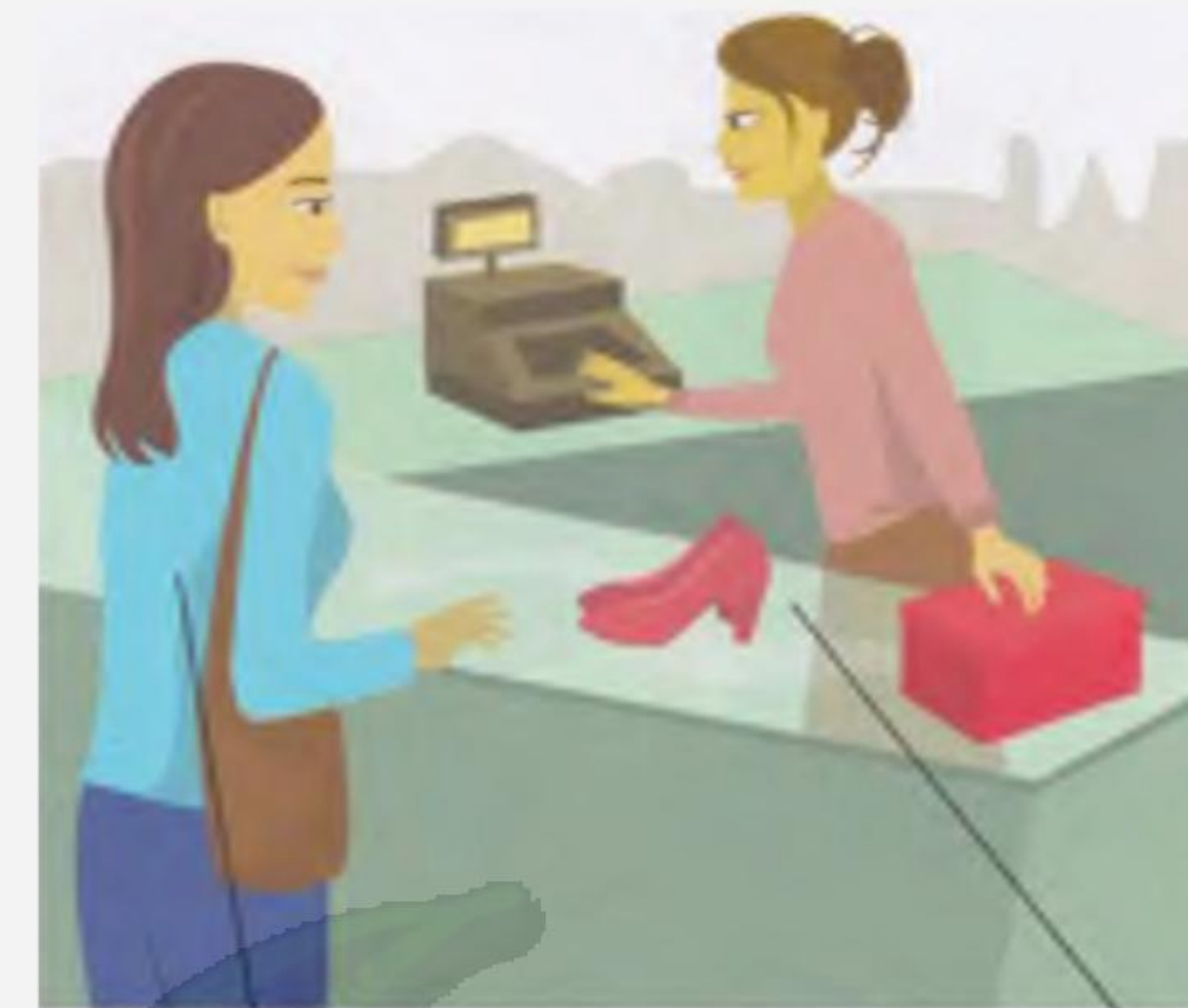
SUE (subject) SOME NEW SHOES (object)