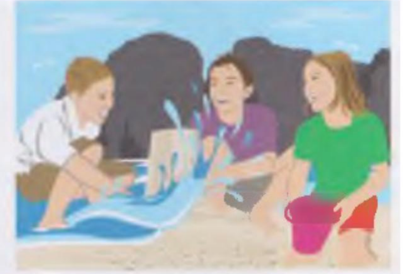
They're enjoying themselves .