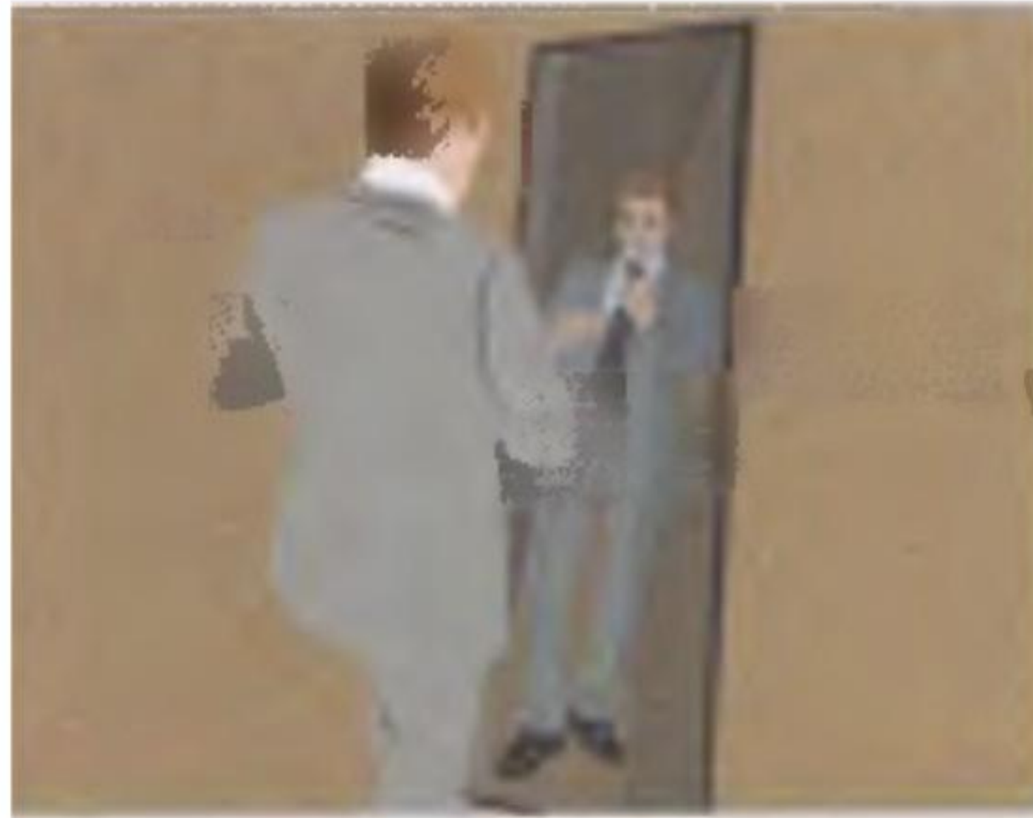
He's looking at himself .